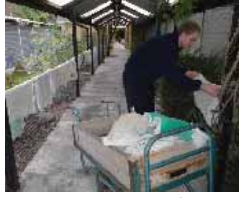
Our covered walkways are great for drying.