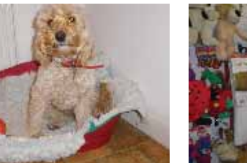
Cookie modeling her vetbed.